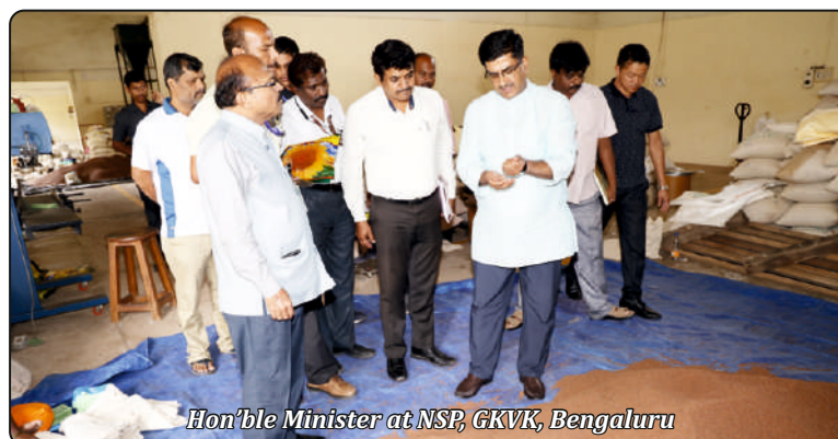
Hon'ble Minister at NSP, GKVK, Bengaluru