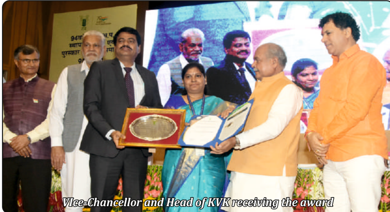
Vice-Chancellor and Head of KVK receiving the award