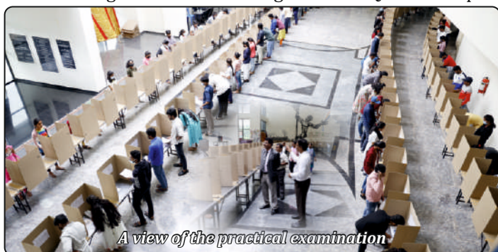
A view of the practical examination

ONLINE VERIFICATION OF DOCUMENTS pertaining to Agriculturist Quota for admission to UG degree programme for the academic year 2022-23 was held from 01-06 July 2022. College of Agriculture, GKVK conducted Practical Test for children of agriculturists under Agriculturist Quota in respect