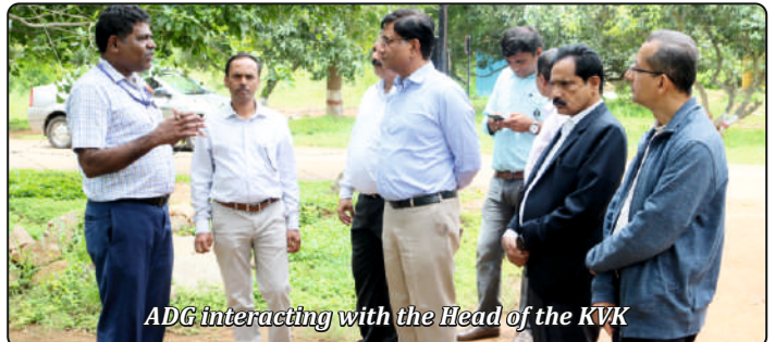
ADG interacting with the Head of the KVK