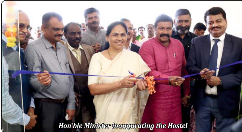
Hon'ble Minister inaugurating the Hostel

SUSHRI SHOBHA KARANDLAJE, Hon'ble Minister of State for Agriculture and Farmers' Welfare, Govt. of India and Shri B.C. Patil, Minister of Agriculture, Govt. of Karnataka inaugurated the new Girls' Hostel 'Nethravathi' funded by ICAR and Govt. of Karnataka at College of Agriculture, Hassan on 4 th July 2022 and wished the students a happy stay. Dr. S. Rajendra Prasad, Vice-Chancellor welcomed the dignitaries and highlighted the progress made by the College of Agriculture, Hassan. Madam Karandlaje mentioned that owing to growth, agriculture sector may contribute up to 25% of the country's GDP and urged the students & faculty to work on effective utilization of millets for their productivity enhancement and value addition. Shri B.C. Patil, appraised about the demand for the courses in the Farm Universities and the prospects for agricultural graduates. He counselled the students to think of Agri start-ups and entrepreneurship opportunities to become job providers and not to be job seekers. Dr. P.H. Ramanjini Gowda, Shri T.M. Aravind, Shri Suresh Margad and Shri R. Srirama, Members of Board of Management of UAS, Bangalore and Dr. S. N. Vasudevan, Dean (Agri.), CoA, Hassan graced the occasion.