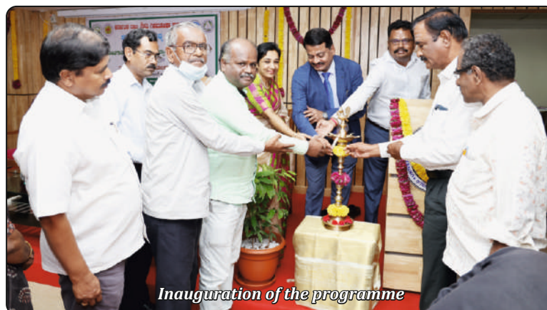
Inauguration of the programme