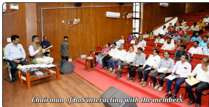
Chairman of BoS interacting with the members