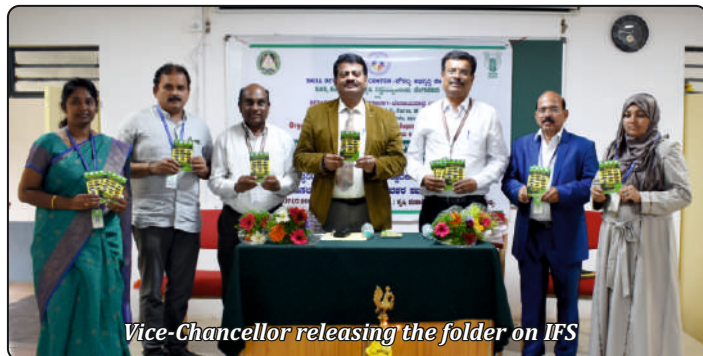
Vice-Chancellor releasing the folder on IFS