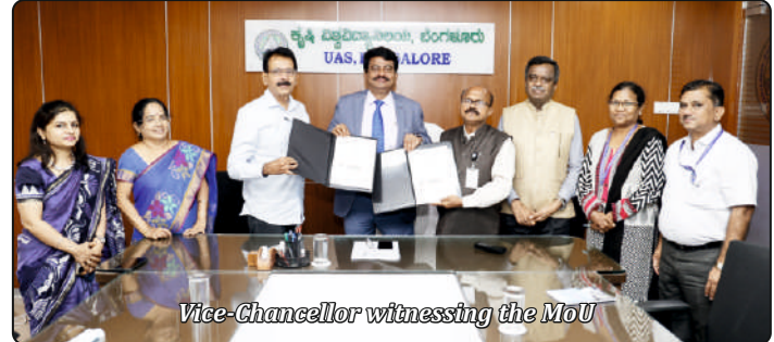
Vice-Chancellor witnessing the MoU

MOU BETWEEN Padmashree Institute of Management and Sciences, Kengeri, Bengaluru and University of Agricultural Sciences Bangalore was signed on 26 th July 2022. The purpose of the MoU is to promote mutual cooperation in education, training, consultation and research activities and