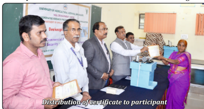
Distribution of certificate to participant

SKILL DEVELOPMENT CENTRE, AICRP on Honey Bees & Pollinators and Department of Apiculture, CoA, GKVK organised a two-day Scientific Beekeeping Training Programme titled 'Commercial Apiculture for Livelihood security of Scheduled Tribe farmers' under ICAR-TSP grants