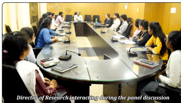
Director of Research interacting during the panel discussion

AS A PART OF PHASE II of International Virtual Course-2022 (IVC) on 'Tackling climate change through global learning', International Panel Discussions on 'Mitigation Strategies to Climate Change' and 'Adaptation Strategies to Climate Change' were organized on 8 th and 12 th July, 2022, respectively for the benefit of participating students and faculty of four countries (India, Switzerland, Brazil and Kenya). Global and local perspectives to tackle the climate change in four different countries was the key points of panel discussion. National key strategies for adaptation and mitigation of climate change especially in the context of food systems and how the national/state strategies are influenced by international politics was briefly discussed. Farmers perception on climate change, actual impact or importance of climate change for the daily life of farmers and their action to take adaptation or mitigation were the other areas of discussion. Dr. Kummer Carmen, Scientist from Zurich University of Applied Sciences, Switzerland visited UAS, Bangalore on 13 th July, 2022. He presented the details on the programmes organized under IVC 2022 and interacted with students.