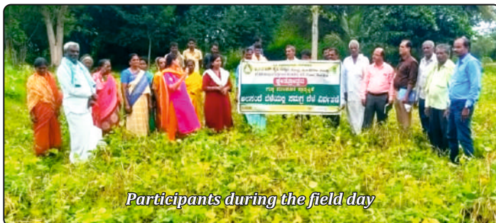
Participants during the field day