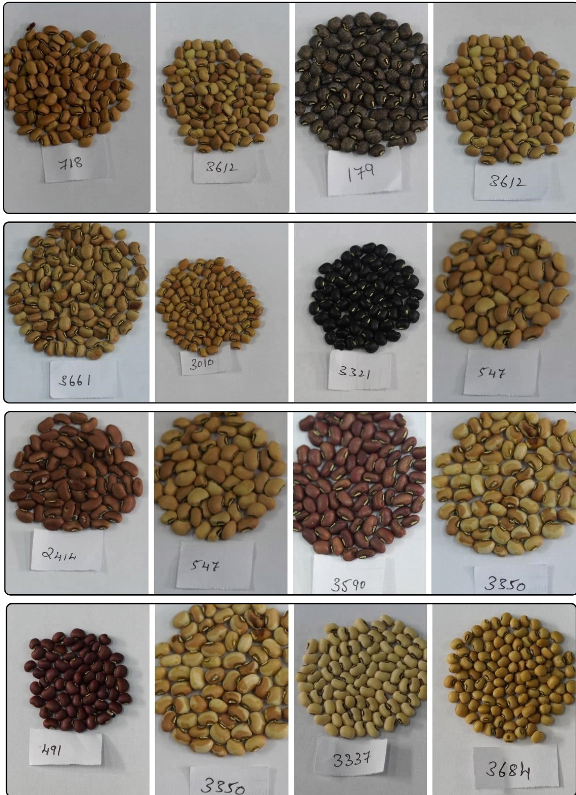
Plate 1 : Variability for seed colour among selected germplasm with high zinc content