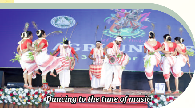
Dancing to the tune of music

During the 5-day long festivities, the contestants gave messages through skit and mono-act with a special focus on subjects touching the Nation and the society. A masterly performance was given by the participants in One Act Play and Mime. Performances of the participants touched the sentiments of the audience by wearing prominent dresses in the Folk Dance of different cultures. Competitors made very good cartoons on the present Indian politics. Participants took part enthusiastically in rangoli and collage making. Students exhibited different forms and thoughts in their painting skills on Indian culture and heritage in on-the-spot painting event. Students expressed their creativity and thoughts on the 'Conservation of Wildlife' in Poster Making.